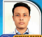
7 TH DHIMAN DATTA 95.6%